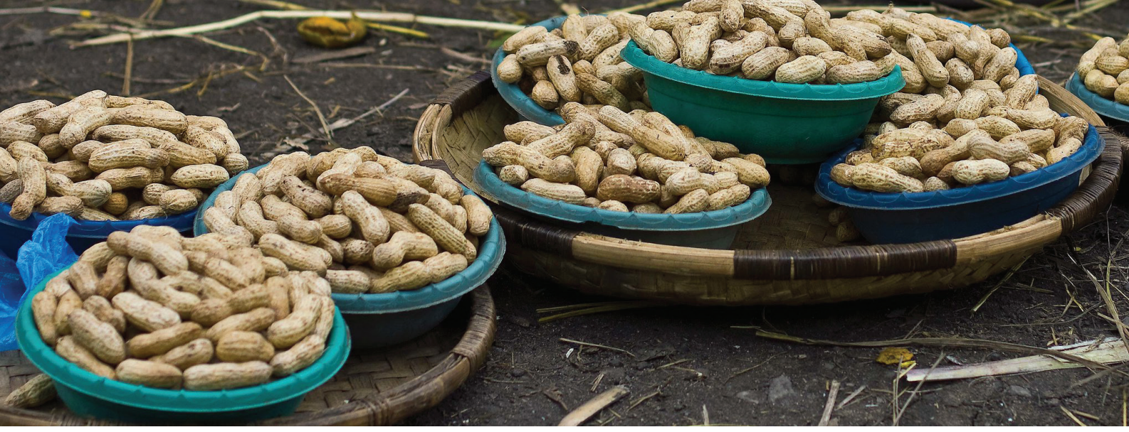
Roadside groundnut sales, Malawi.

Our analysis shows that a percentage point increase in the access of materials from the genebank is associated with a 0.013% increase in the area under the adoption of improved groundnut varieties.