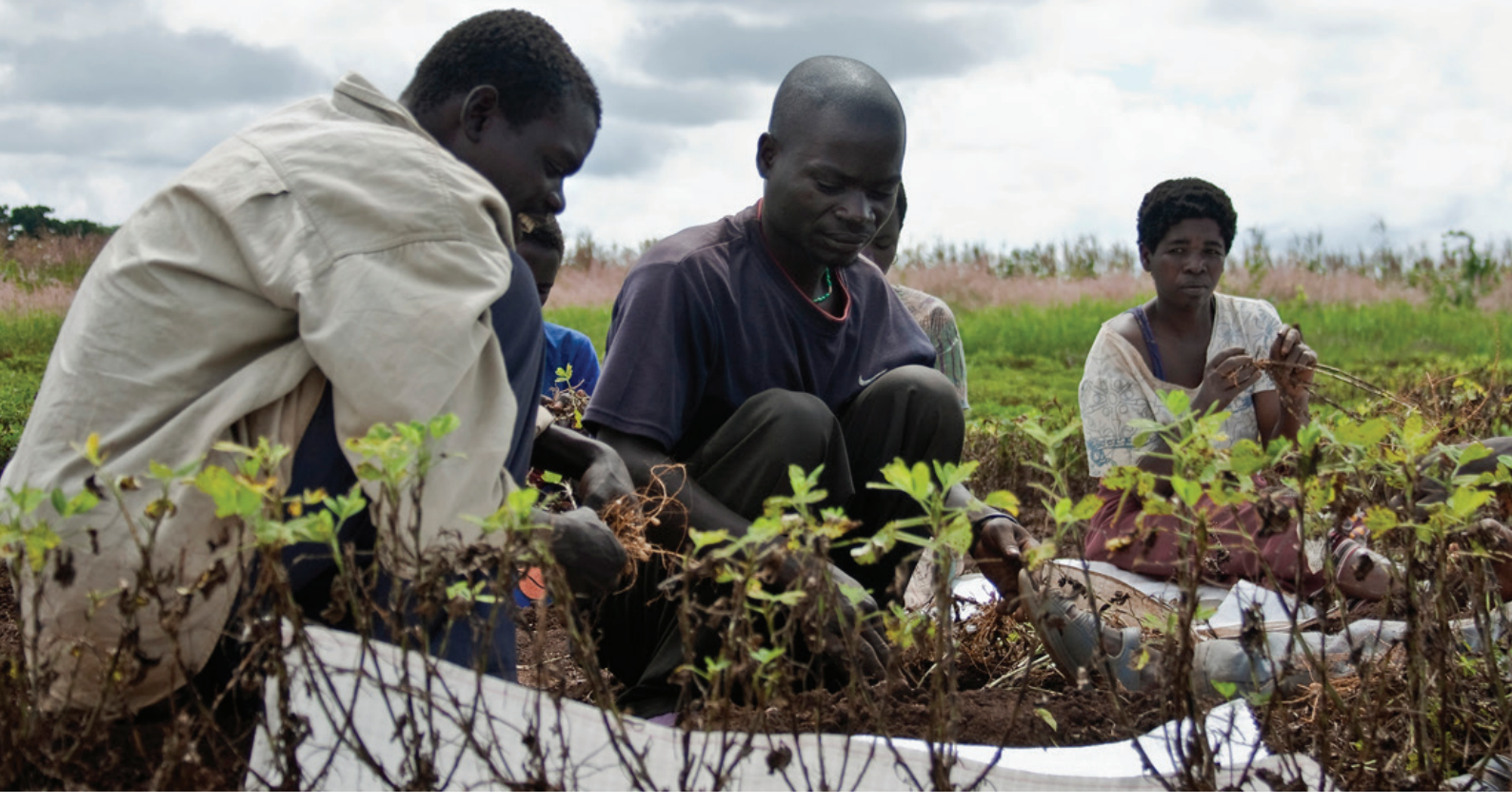
Groundnut harvesting at Chitedze Agriculture Research Station, Malawi.

also provide learning to the targeting and upscaling of improved crop varieties as this may have the intended welfare increasing and poverty reduction effects. As genebanks are an important source of germplasm and advanced breeding lines, it may be largely inconclusive to ignore the genebanks in such efforts. Significant policy and institutional support should be provided to the genebanks to strengthen their role in conserving and ensuring the availability of crop germplasm, breeding materials, and related information.